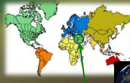
The Fertile Crescent