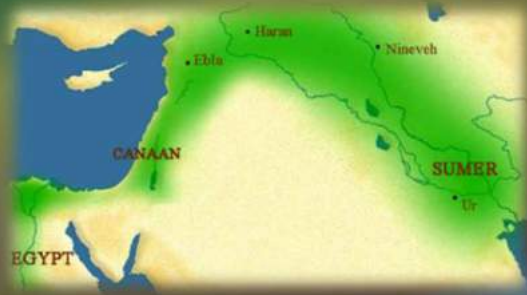
The Fertile Crescent