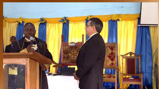
Giving of an African Name: "Mana" (Blessing)